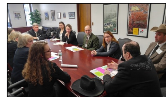
Senator Rich Funke meets with Monroe and Ontario County Farm Bureaus at Lobby Days.