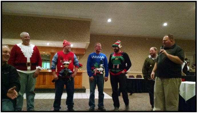
The ugly holiday sweater contest was one of the highlights of the evening.

THANK YOU to all the businesses, organizations and local farms who sponsored the evening, donated some wonderful raffle items and to those that came out to support us in this endeavor. The partnerships we have developed with all of you are truly making a difference. We are looking forward to next year!