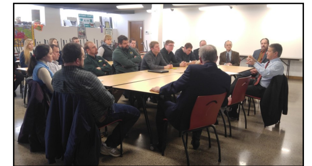
Wyoming County Farm Bureau members meet with Senator Patrick Gallivan in Warsaw on Feb. 8

Please call early as attendance is limited to 100