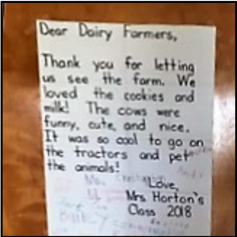
A sweet thank you note from Homer kindergartners after their fun visit to New Hope Farm. Read more about their visit inside.