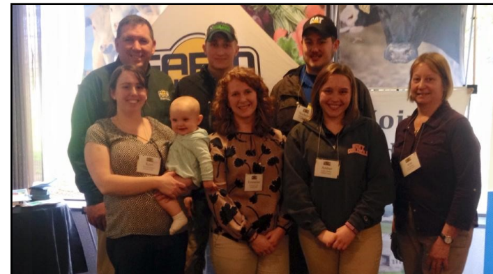
Last year's Genesee County conference attendees.

For detailed agenda: http://www.nyfb.org/news_and_events/