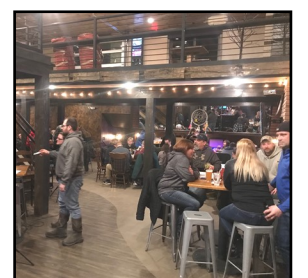
Fun on Trivia Night