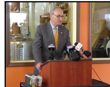
Senator Schumer speaks to the media in Williamson about changes to the Alcohol and Tobacco Tax and Trade Bureau regulations that would help benefit New York Cideries