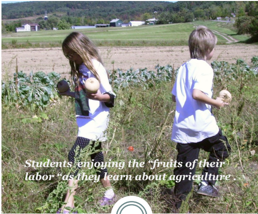
Students enjoying the "fruits of their labor" as they learn about agriculture.