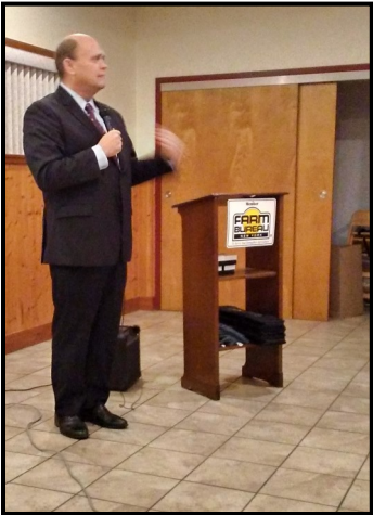
Pictured above left: Congressman Tom Reed addressed the group with updates on the state of affairs in Washington, DC. He also answered several questions from the audience.