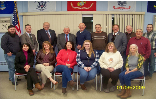
Pictured: Allegany County Farm Bureau members with Allegany County legislators