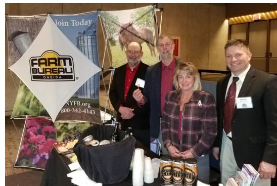
Oneida County Farm Bureau members at their booth stocked with samples from Copper City Brewing, Grassy Cow Cheese Curd and Jake's Gouda Cheese during NYFB's Taste of New York Reception.

It was a successful trip, and I'd encourage any Farm Bureau member to make the journey at least once to meet with elected officials and promote New York State agriculture.