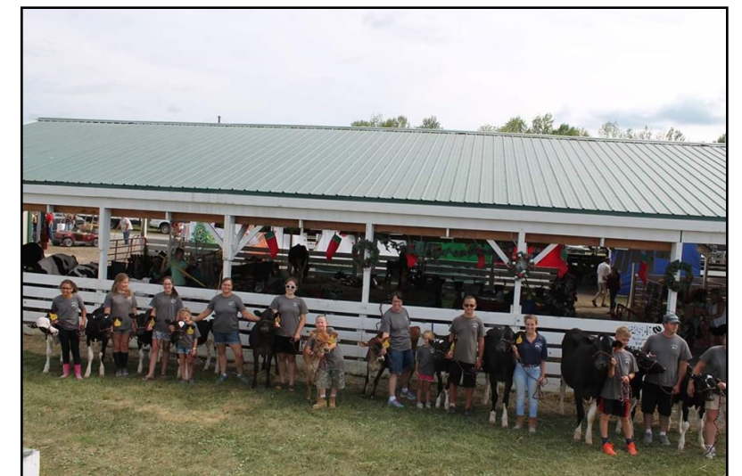
The 4-H group with their heifers at the Hemlock Fair.