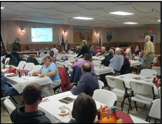
Members and guests attend the County Annual Meeting and Dinner.