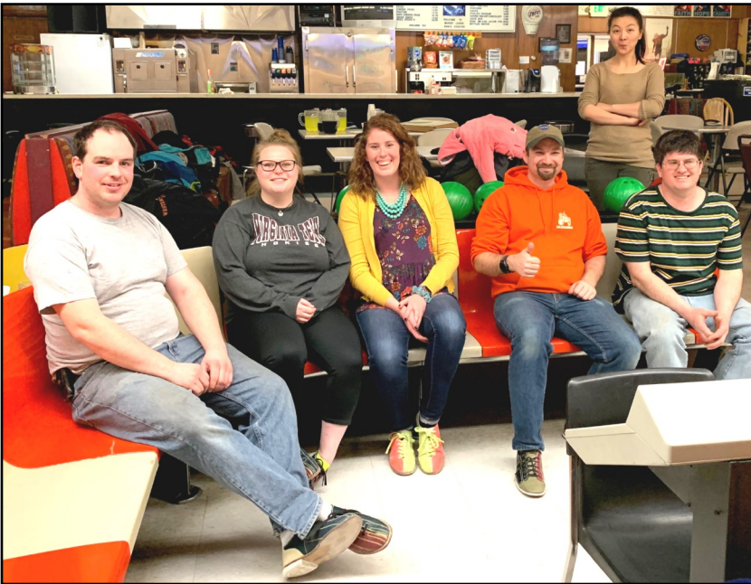
On Sat., March 9, young farmers from St. Lawrence County gathered to beat the wintertime blues. Members bowled at Market Lanes in Potsdam and shared food, drinks and conversation.