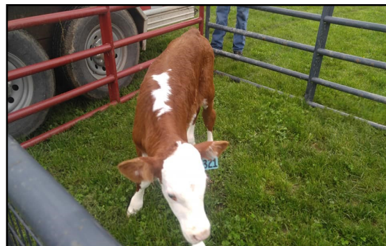
This little calf from Poverty Hill Farms was a big hit with the kids. Thank you to Upstate Niagara for donating milk to drink at this station.