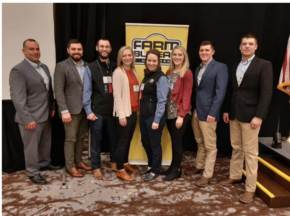
Livingston County Board Members at the State Annual Meeting in December 2019.