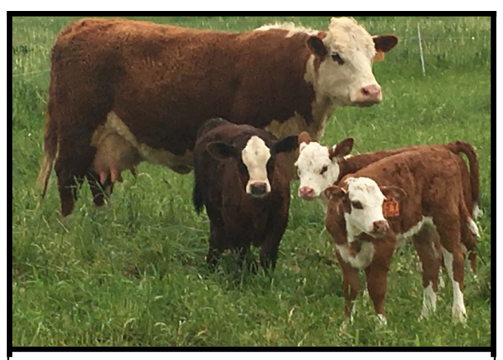
Beef cows in the pasture at board member Anne Lincoln's Woods 'N River Farm.