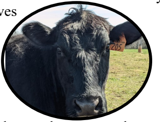
Shedding out the winter woolies at Ben Wever Farm.

July 22 at 5 p.m. Ben Wever Farm 444 Mountain View Dr., Willsboro