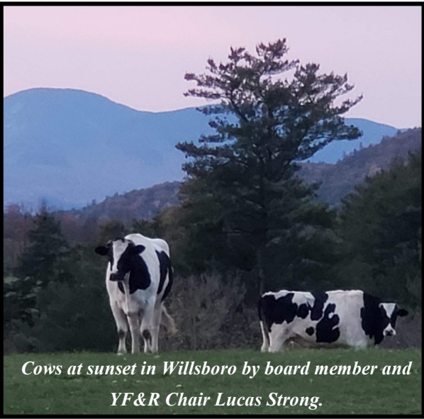
Cows at sunset in Willisboro by board member and YF&R Chair Lucas Strong.

CCE-Essex is open and staffed on a rotating basis to avoid overcrowding the office. We will continue to offer workshops and classes online to the extent possible; please visit our website for current offerings. You may reach our staff by visiting the staff page on our website at http://essex.cce.cornell.edu/staff for their email address or by calling 518-962-4810. Our phone system or office staff will forward your voice message to them via email. As always, we're here to help with information and people you can trust!