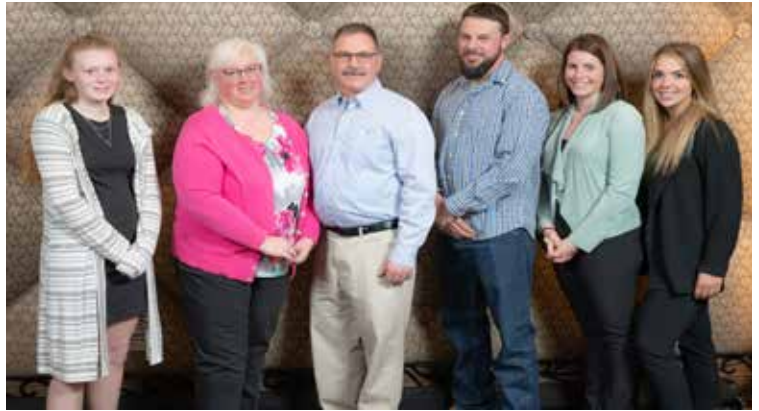
Ontario County Agriculture Appreciation Banquet award recipients.