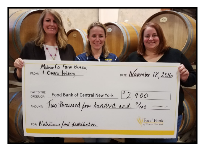
MCFB and Owera Winery were proud present a check to the Food Bank of Central New York with a check for $2,400 from this wonderful event last year.

Madison County Farm Bureau is taking over the tasting room at Owera Vineyards for a night of fun, food, wine, beer, spirits and live entertainment— all to benefit a worthy cause, the Food Bank of Central New York.